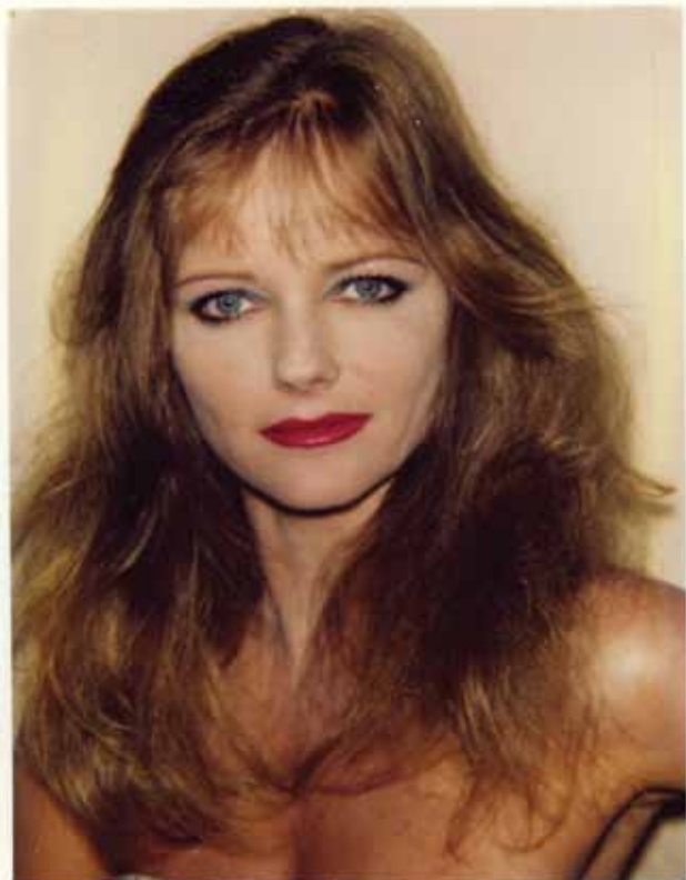
▲ Image Machine: Andy Warhol and Photography Many of Andy Warhol's most recognizable pieces—prints of Marilyn Monroe or paintings of Campbell's Soup—used photographs as source material. But only recently has Warhol been recognized for his own stark photographic work. Contemporary Arts Center, Sept 22–Jan 30

For more information, visit fotofocuscincinnati.org