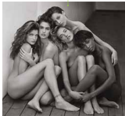
► Herb Ritts: L.A. Style A master of simplicity, Herb Ritts used the bright Los Angeles sun to tease out the contrast between dark and light, creating portraits that made celebrities look like Greek gods and transformed fashion photography into art. Cincinnati Art Museum, Oct 6–Dec 30

OCTOBER 1 2 3 4 5 6 7 8 9 10 11 12 13 14 15 16 17 18 19 20 21 22 23 24 25 26 27 28 29 30 31