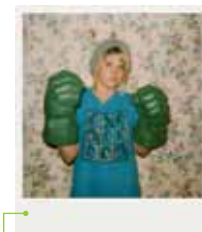
◀ Laurel Nakadate: Polaroids from Stay the Same Never Change Through more than 150 Polaroids, Nakadate follows her subjects on their personal journeys. Her work explores gender issues, such as the allure and unease that comes from the way men look at women. The Art Academy, Oct 4–Oct 31