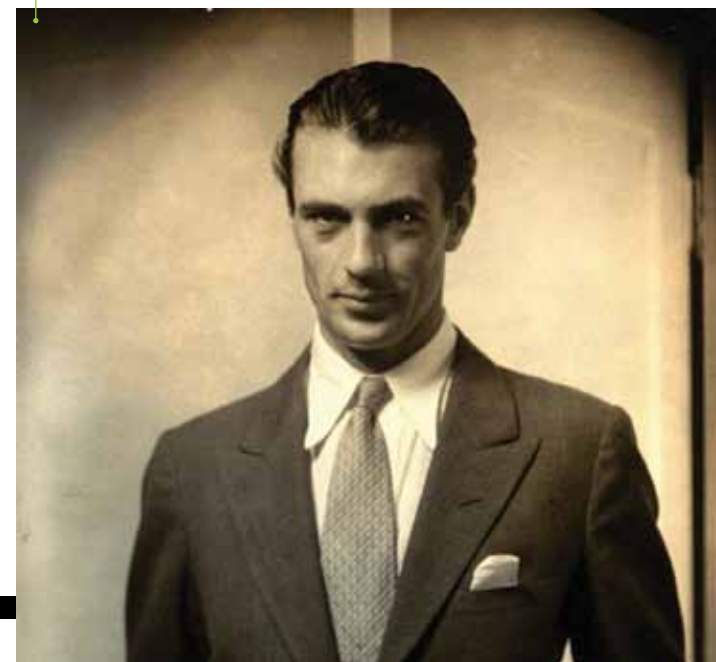
Star Power: Edward Steichen's Glamour Photography Just in time for the Taft Museum's 80th anniversary, an exhibit examining the life and oeuvre of Edward Steichen, whose work in fashion magazines made him the most famous (and highly compensated) photographer of the '20s and '30s. Taft Museum of Art, Oct 12–Jan 27