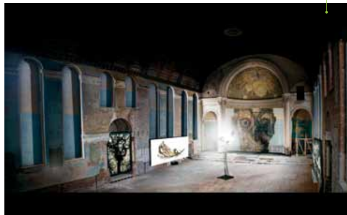
▲ Doug+Mike Starn: Gravity of Light Conceptual artists and identical twins Doug and Mike Starn got a lot of attention with their exhibit Big Bambú at New York's Metropolitan Museum of Art. Their installation uses an arc lamp to explore the meaning of light. Holy Cross Church at Mt. Adams Monastery, Oct 6–Dec 30