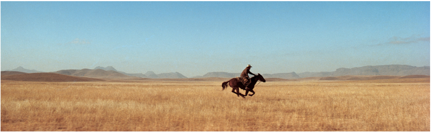
William Albert Allard, "Lone Rider, Texas", 1974. Courtesy Northern Kentucky University Art Gallery and the artist.